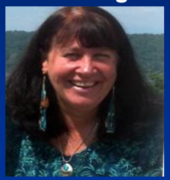
Immersion Training Developer, Storyteller