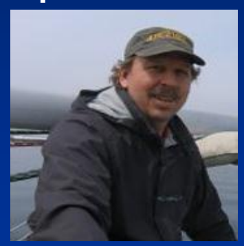
Software Developer, Physical Therapist, Artist, Sailor